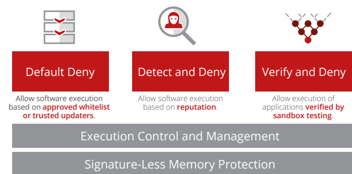
Figure 1. Three ways to maximize your whitelist strategy.

As users demand more flexibility to use applications in their social and cloud-enabled business world, McAfee Application Control gives organizations three options to maximize their whitelisting strategy for threat prevention as illustrated here.